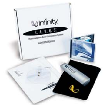
The Infinity R.A.B.O.S. kit is included with every TSS-4000 subwoofer.

The TSS-4000 subwoofer system uses a refreshingly simple and effective approach to achieving smooth bass response. In effect, it's optimized it to the listening room once it's in place. The TSS-SUB4000 will sound better in more typical listening room configurations than any other subwoofer in its class.