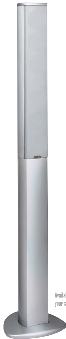
Available floor stands continue the contours of your speakers for attractive floor placement.

The included base for the center channel allows you to direct the sound toward the listening area whether you place it above or below the television.