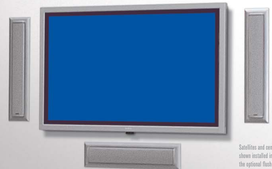
Satellites and center channel shown installed in the wall using the optional flush-mount kit.